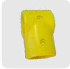
101 SHORT TEE