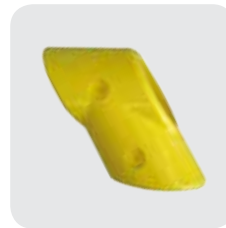
129 30° TEE