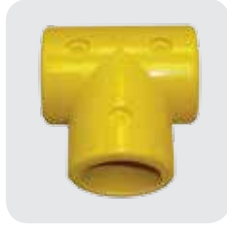
104 LONG TEE