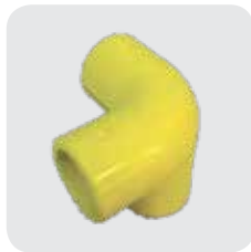
128 TOP CORNER