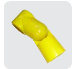
173 SINGLE SWIVEL