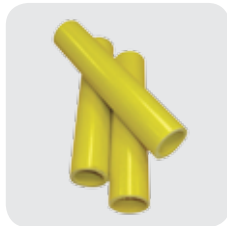
50MM TUBE - 5M