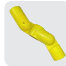
167 DOUBLE SWIVEL