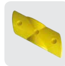
130 30° CROSS