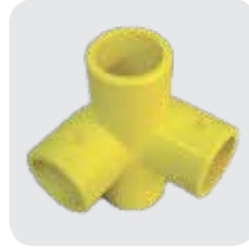
116 MID CORNER