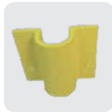
145 SIDE FIX PLATE